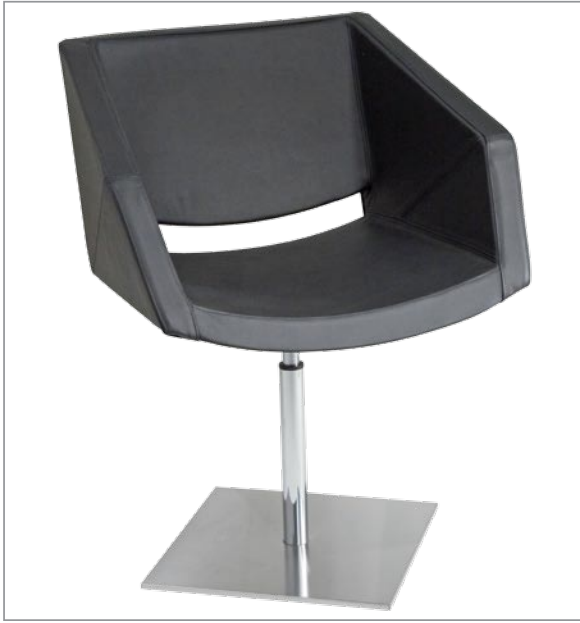
Xonia Swivel Armchair