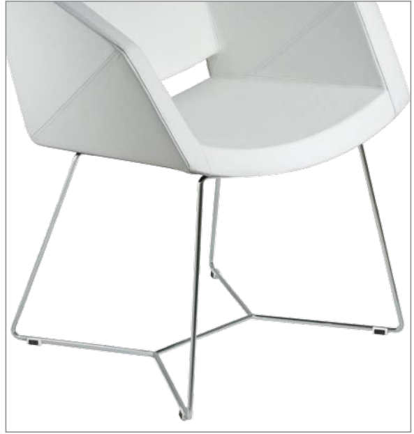
Xonia fixed sled base design detail