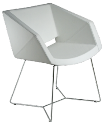
XONIA CLUB CHAIR

The Xonia Swivel Club Chair design has a geometric design sled base and is available with a Inox stainless steel square swivel base. Upholstered in faux or genuine leather.