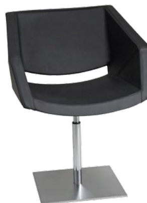
XONIA SWIVEL CLUB CHAIR