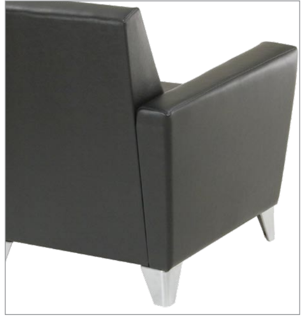
Flair Lounge back detail