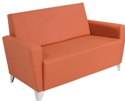
FLAIR TWO SEAT LOUNGE