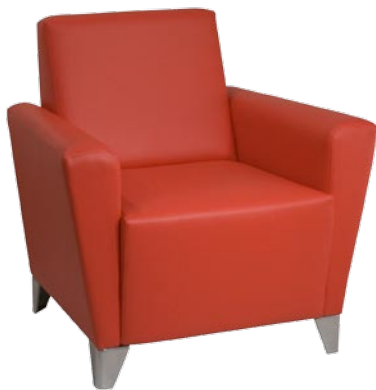
FLAIR ONE SEAT LOUNGE

The Flair Lounge design includes polished aluminum legs in one or two seat lounges.