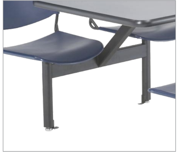
Delfi floor mount detail