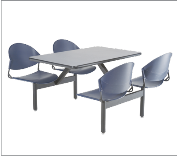
Delfi 4-seat Cluster