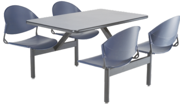
DELFI 4-SEAT CLUSTER UNIT

Delfi Polypropylene shells are highly contoured on both seat and backrest. Choose from many shell color choices. Seats are swivel type with automatic return. Seat and back can be ordered with upholstery inserts.